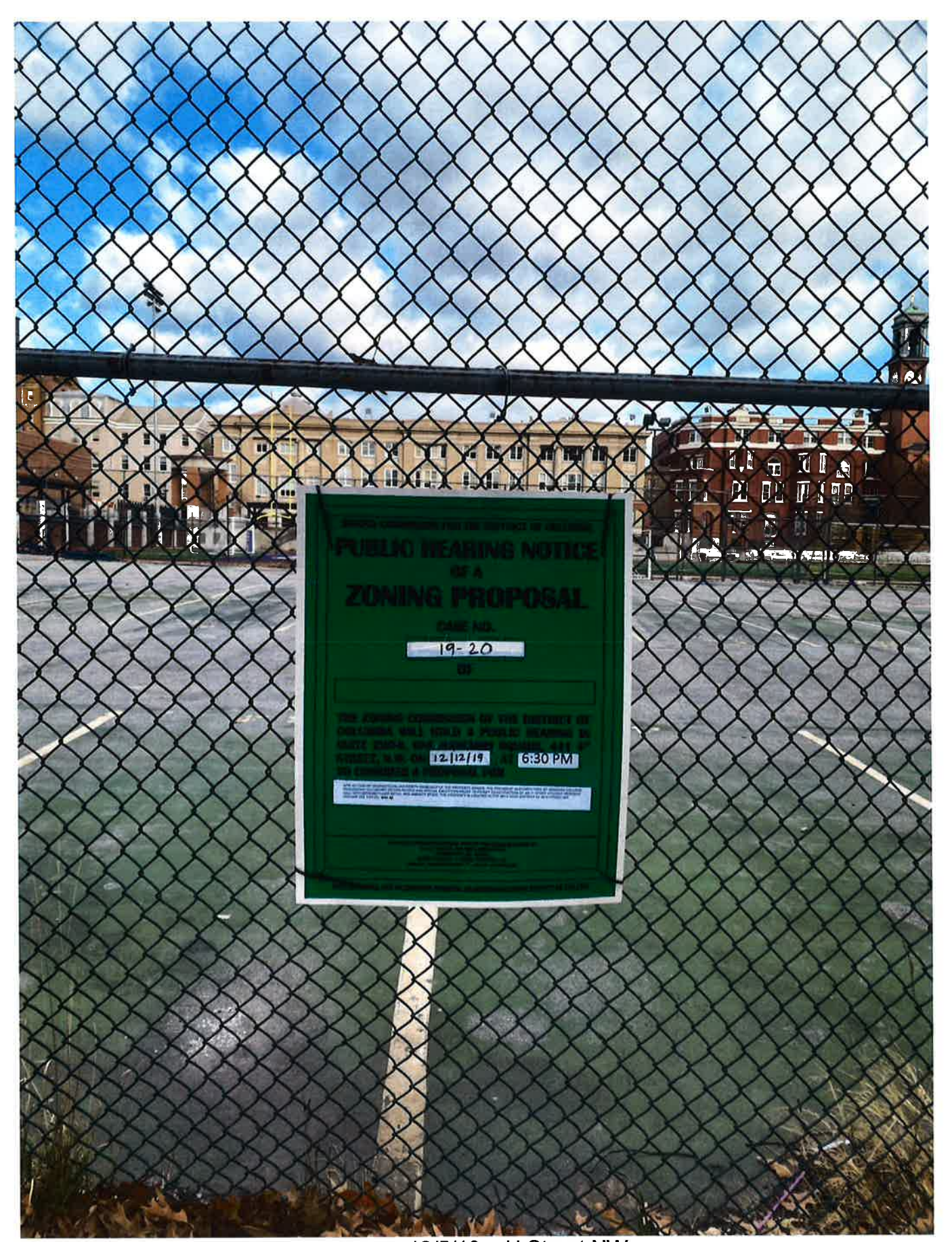
12/5/19 - H Street NW