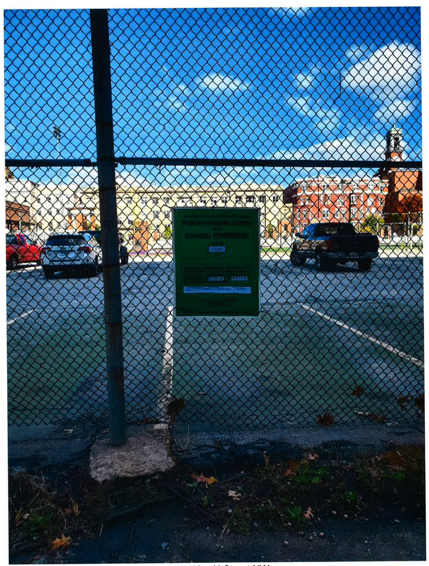
11/1/19 - H Street NW